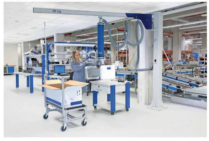
Aluminum flat jib

The new aluminum flat jib from Schmalz optimizes the heigth of jib cranes for working with vacuum tube lifter Jumbo in rooms with low ceiling.